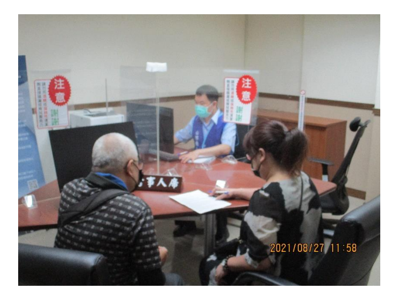
Shilin Branchallows obligors to pay in installments based on caring and lenient enforcement policies for disadvantaged obligors.