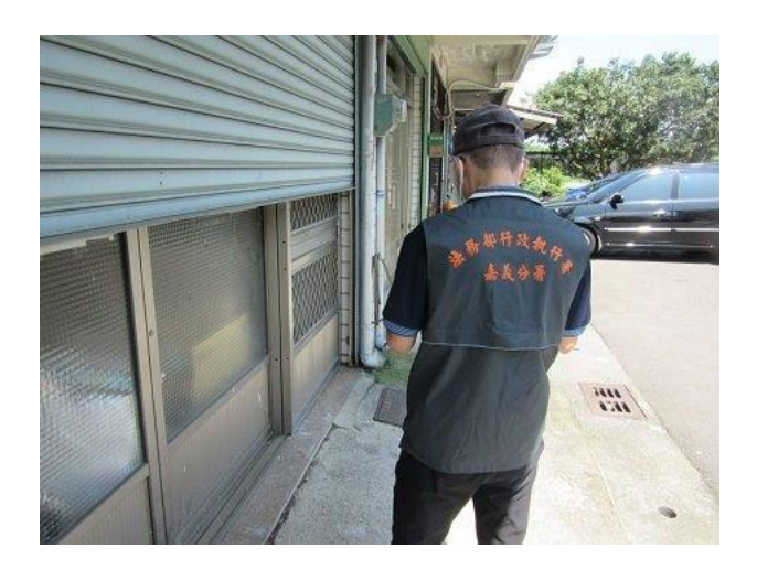
Chiayi branch implemented on-site enforcement at the cram school.