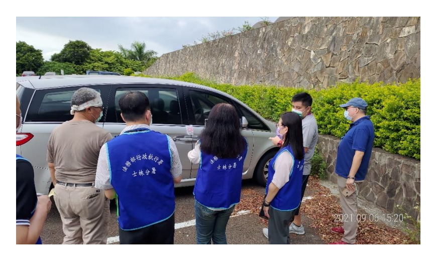
Shilin Branch implemented the special project of epidemic prevention to seize automobiles at Tamsui Augusto Crown Golf Course